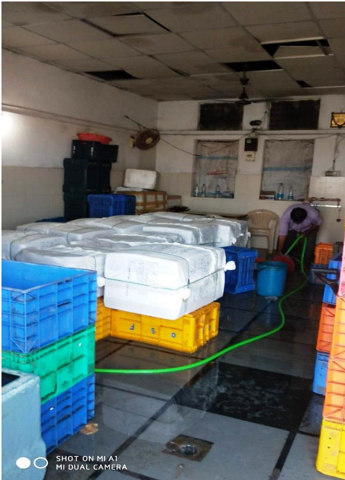
SHOT ON MI A1 MI DUAL CAMERA