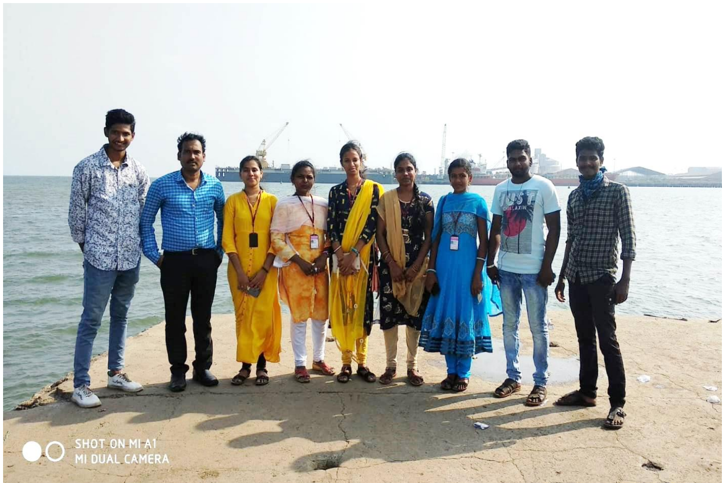
Field Visit to Central Institute of Fisheries Education ( ICAR), Kakinada, Andhra Pradesh.