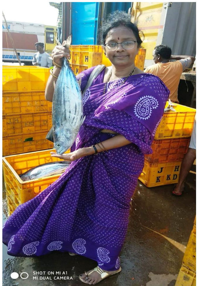
SHOT ON MI A1 MI DUAL CAMERA