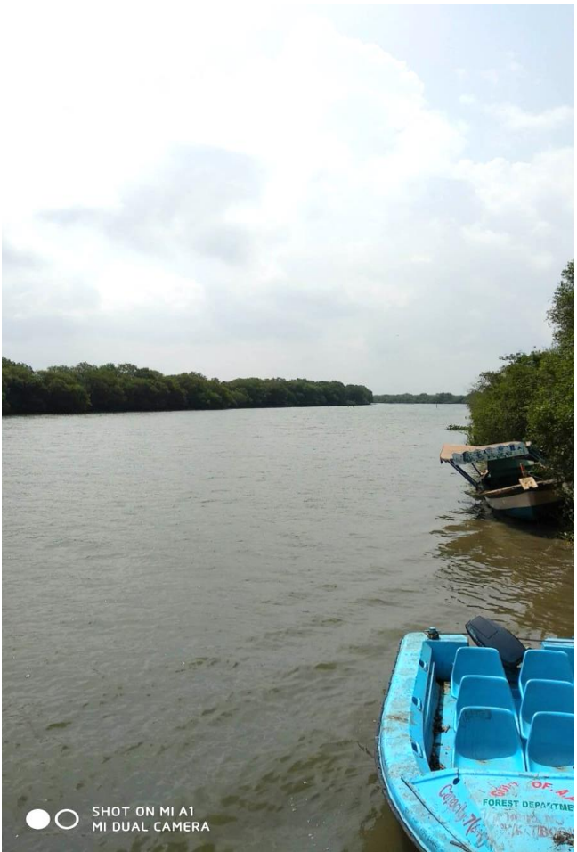
SHOT ON MI A1 MI DUAL CAMERA