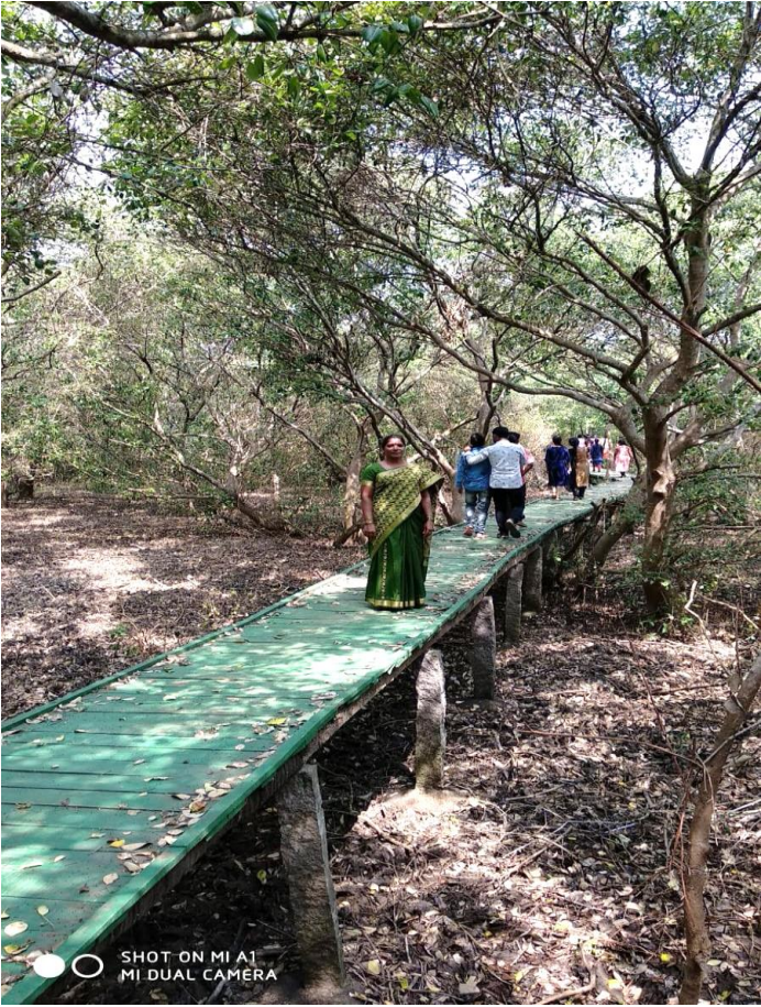
SHOT ON MI A1 MI DUAL CAMERA