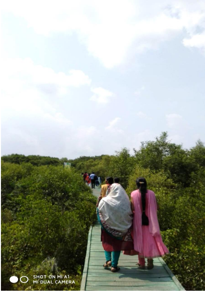
SHOT ON MI A1 MI DUAL CAMERA