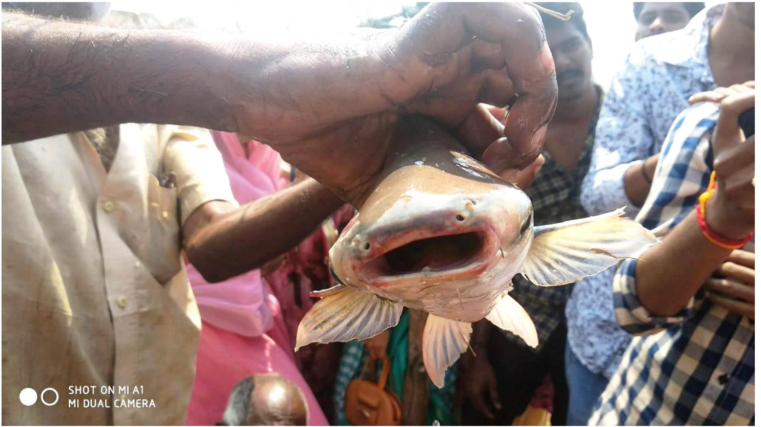
SHOT ON MI A1 MI DUAL CAMERA