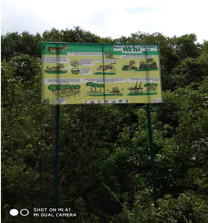
SHOT ON MI A1 MI DUAL CAMERA